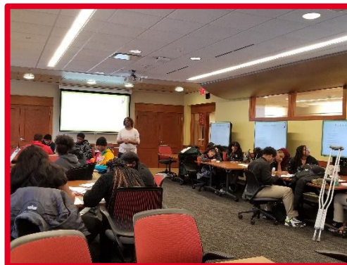
Bearcats Academy students participating in a UC Library workshop.