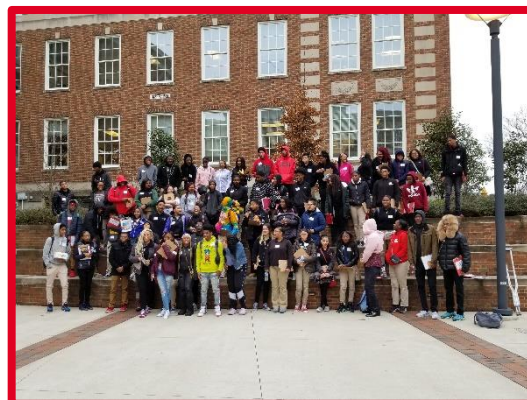
Bearcats Academy students at UC College of Education